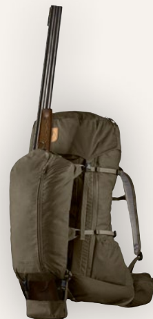
Gun holder The front pocket functions as a gun holder during long approaches.