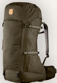
Scaled down Without the front pocket the backpack has a slimmer silhouette.