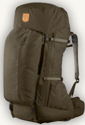
Lappland Friluft 45

Functionality and details that let you focus on your hunting experience