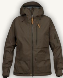
Lappland Eco-Shell Jacket

Fjällräven continues its commitment to nature by expanding its use of award winning Eco-Shell