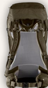
Carrying comfort Fixed-length, well-ventilated back panel and ergonomically shaped shoulder straps, supple enough to use with a gun.