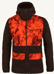
Lappland Pyrsch Jacket

Fjällräven is focusing on silent and sustainable materials