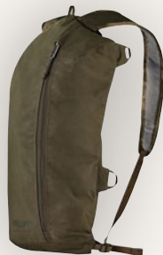
Smart front pocket The front pocket can be detached and used separately as a minimalistic backpack.